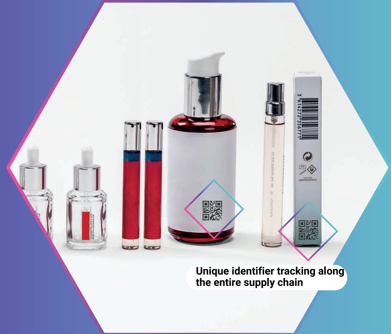
Unique identifier recording in database

There are multiple methods to apply a unique identifier to your product. It can be directly printed using various printing technologies such as inkjet, laser, thermal transfer, etc., onto different data carriers like QR codes, Datamatrix, or 1D codes. Alternatively, the identifier can be written onto RFID and NFC tags. The most suitable solution for your product is determined based on your specific requirements and product characteristics.